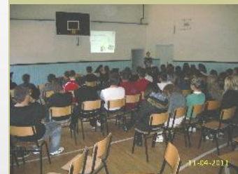
NGO Prodolzen zivot- Strumica