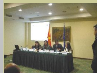
H. Holiday Inn-Skopje 05/12/2011